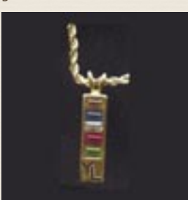
It So Simple14K Gold Pendant - Synthetic Stones