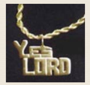
Original 14K Gold Pendant with chain